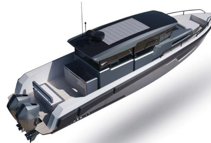
WETBAR, AFT SEATING